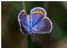
Karner Blue Wikipedia Monarch Audrey E. Willson

The decimation of the prairie lands has led to the extirpation of the Karner Blue Butterfly and the Monarch is now a Species at Risk. ▶