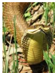
Ken Towle, GRCA

The Eastern Hog-Nosed snake and Milk snake are also at risk and the partners of the RLPJI are working with local landowners to encourage them to preserve the natural habitat for these species. Invasive species are removed and replaced with native species of grasses. Fire is an important element in prairie restoration and the naturally occurring fires which are now suppressed have been replaced with professionally-managed prescribed burns to bring new life to these threatened places.